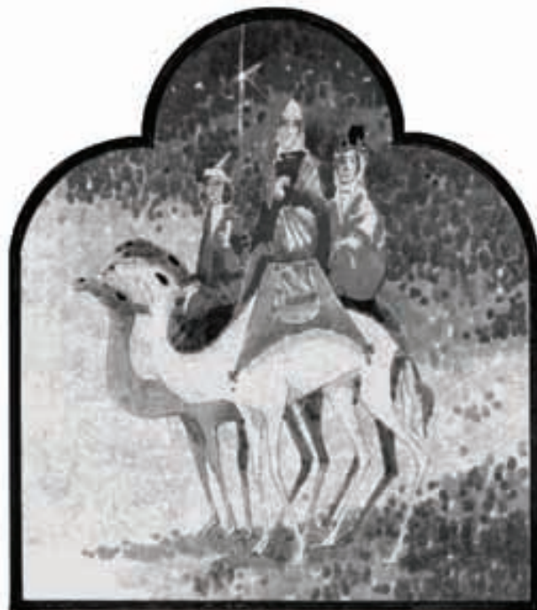
Magi from the east arrived